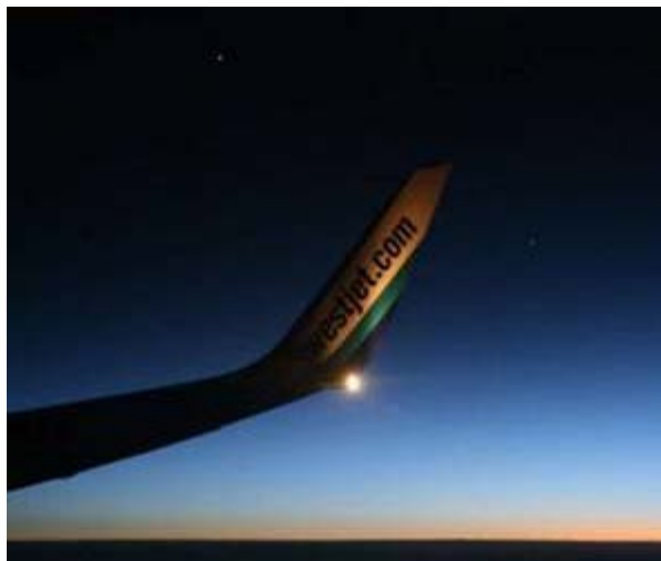
Venus and Jupiter from 11,500m, 2008 December 16