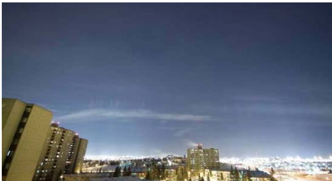
Jesse Houston captured a row of pillars from streetlights on a crisp Edmonton night. When the aurora does not move after a few seconds, suspect a pillar!

I remember one superb cold night in Montreal when ice crystals filled the lower atmosphere. Several people phoned in to the police and radio stations to warn them that the aliens had landed and were pointing their search-beams upward!