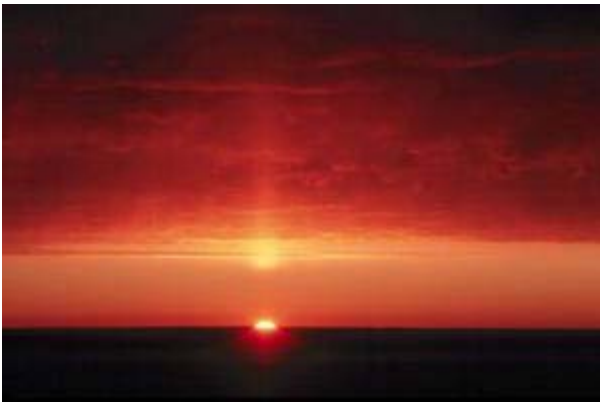
A classic solar light pillar: ice crystals reflecting the Sun.

This is the best time of year to see light pillars. Most commonly seen just before sunrise or just after sunset, pillars aptly describe the vertical shaft of light that is seen shooting skyward above the position of the Sun.